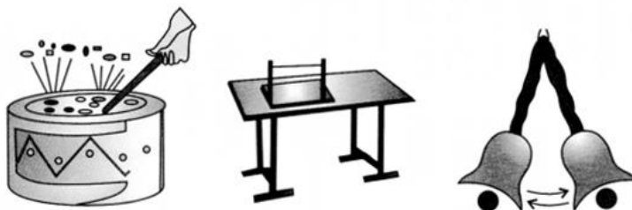
Some objects in periodic motion